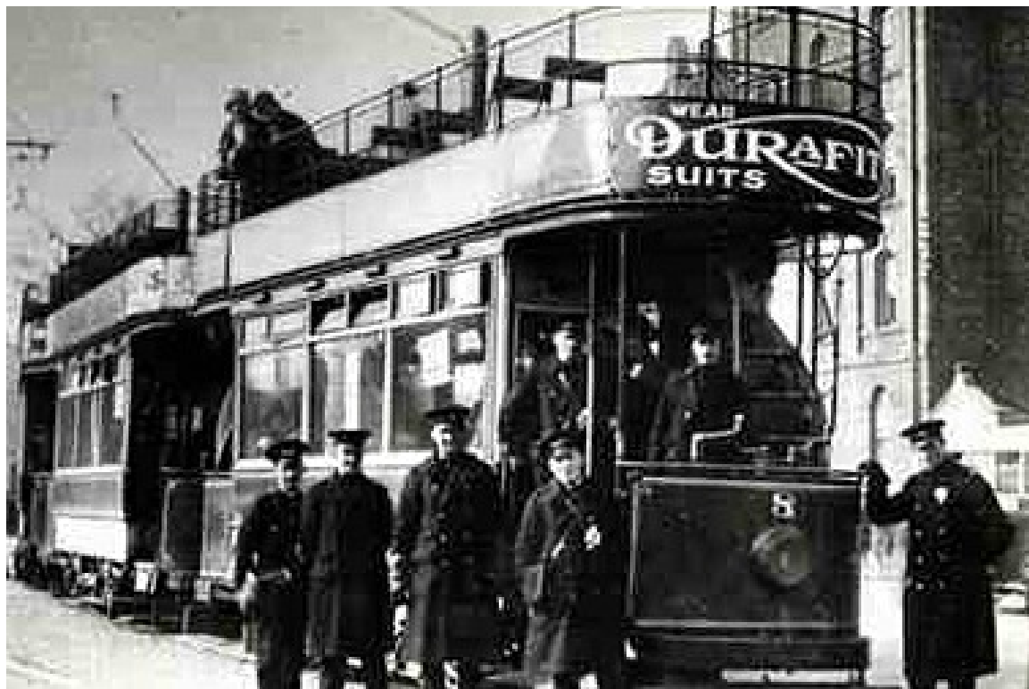
Car No. 8, destined to be Carlisle's last tram in 1931 was a 1912 UEC-built 48-seat car on Brill 21E trucks. (LTHS collection).