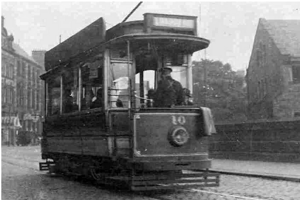
Tram No. 10 a 1912 UEC-built 24-seat saloon car making its way over the viaduct to Dentonholme. (LTHS collection).